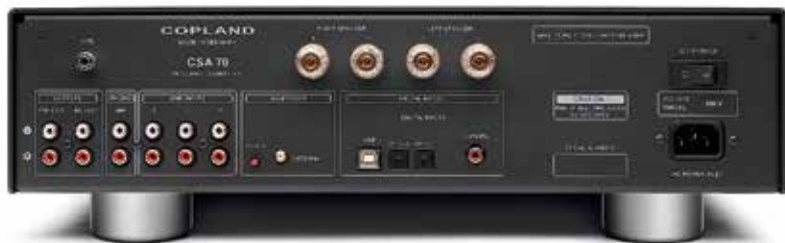
ABOVE: MM phono is joined by three line ins on RCAs, a fixed line out and variable preamp out and single sets of 4mm speaker terminals. Digital inputs include coaxial, two optical and USB. The optional Wi-Fi/BT streaming adapter is also included here

is assembled from five gigs spanning 22 years, the fun was following along with the liner notes to hear if the CSA70 could convey the subtle changes, and not just in the natural aging of this singer's distinctive voice. Which it did, with ease.