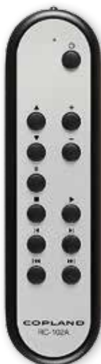
LEFT: Copland's rubber-edged RC-102A system remote caters for its legacy CD player and, for the CSA70 amp, offers standby and volume plus input selection

challenge to the CSA70 was that distinctive, growly voice, along with crystalline backing from Dr John on piano, as well as other New Orleans luminaries. Let's dispense with